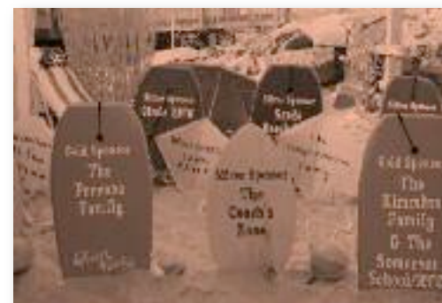
2008 Sunset Clambake Sponsors

2nd Annual Sunset Clambake Sunday, September 13, 2009